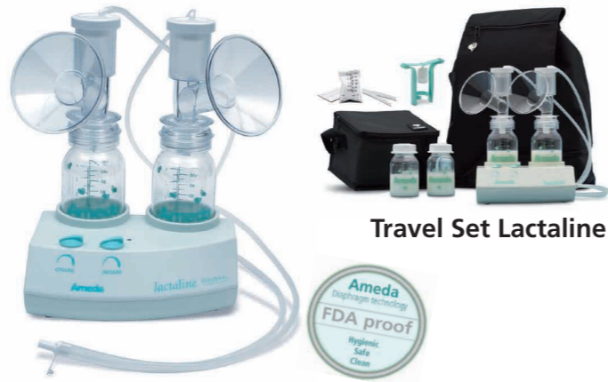
Travel Set Lactaline

The Lactaline personal is the world's smallest, electric, interval double breast pump and offers ultimate mobility. It is easy to handle, small, quiet and efficient – the favorite breast pump for private use. The vacuum and cycle can be adjusted separately and continuously to meet the specific needs and requirements of the mother. The pump meets the highest hygienic standards and can also be battery operated.