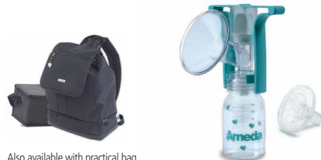
Also available with practical bag.

The One-Handed Breast Pump is designed for one-handed operation. The ergonomically designed and rotatable grip takes the effort out of expressing the breast milk and leaves a hand free for breast massage.